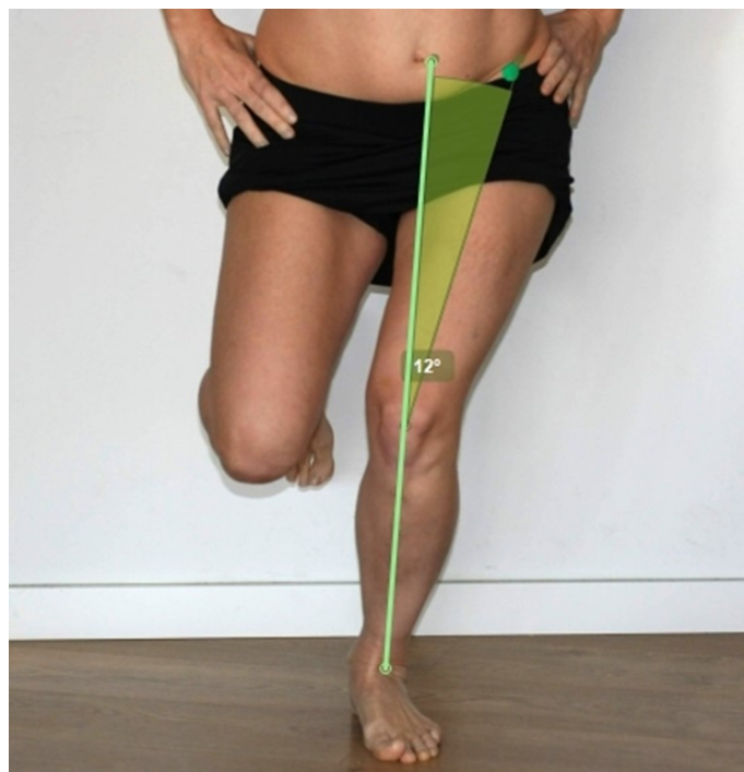
Figure 1. Variable FKPA (measured with Kinovea).

For the recording of the test, one digital camera (Samsung ST66, Samsung, South Korea) was placed on the frontal plane, on a tripod at 110 cm in height and separated 4 meters from the jump box (30 cm high). The app Kinovea (GPLv2 license) was used to analyze the jump and to obtain the variable FKPA. FKPA was calculated measuring the angle formed by the markers placed at the anterior superior iliac spine, patella and center of the ankle ( Figure 1 ).