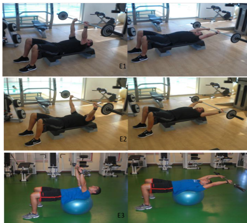
Figure 1. Illustration of the three pullover exercises: lying on a step with a barbell and grip 100% biacromial (E1), lying on a step with a barbell and grip 150% (E2), lying on a Swiss ball with a barbell and grip 100% (E3).

The subjects started every exercise lying in a supine position, with their arms raised perpendicular to their trunk, knees bent at 90^\circ and feet on the ground. They were instructed to maintain a slight elbow flexion during the entire movement. Starting from this position (initial position of eccentric phase), the subjects had to flex the upper arms backward at the shoulders, until they were parallel to the ground (final position of eccentric phase, and initial