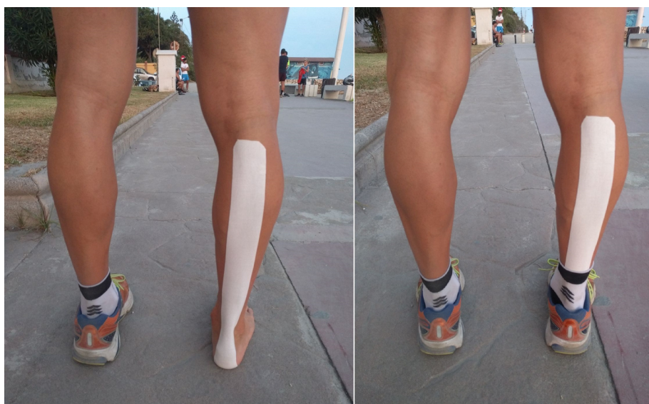
Figure 2. Application of the kinesio tape to the (right) calf using the I-shaped taping technique.

The purpose of the present study was to examine the effect of KT on calf pain in healthy runners immediately after a half marathon. Contrary to the present research study, most of the studies about the effect of KT on pain have been conducted on